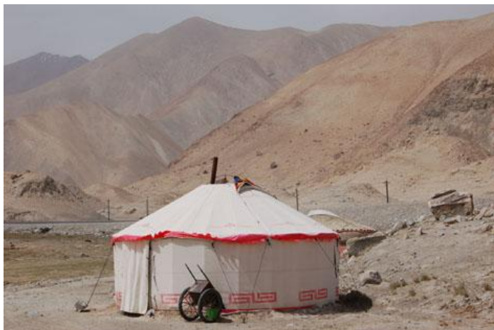
Kazakh yurts at Lake Karakuri in the shadow of Mount Maztagata