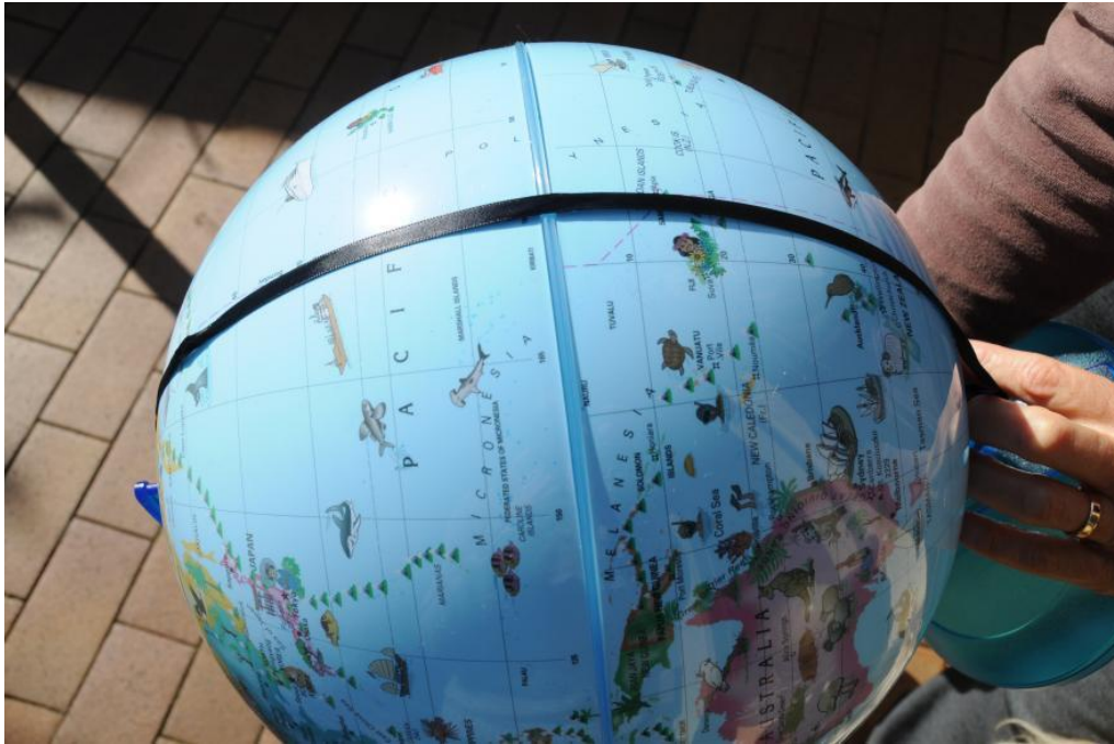
Using a ribbon on the globe to show the location of the International Date Line