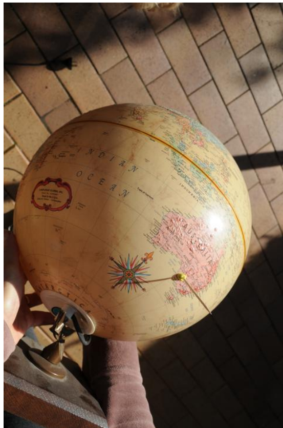
Using a toothpick to show the location of your town or city in relation to day or night