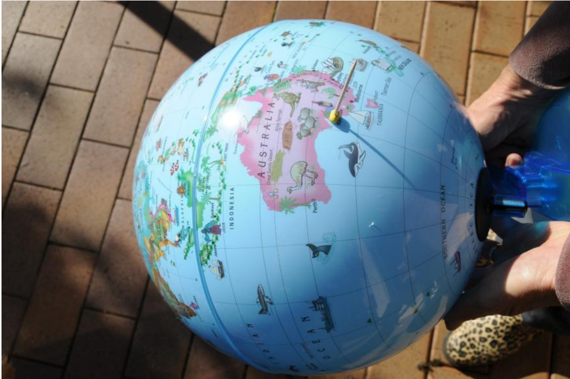
Using the globe outside to show where different places are in relation to the sun