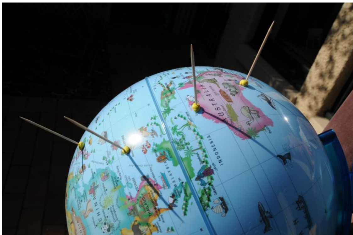
Using toothpicks to show day and night on different sides of the globe