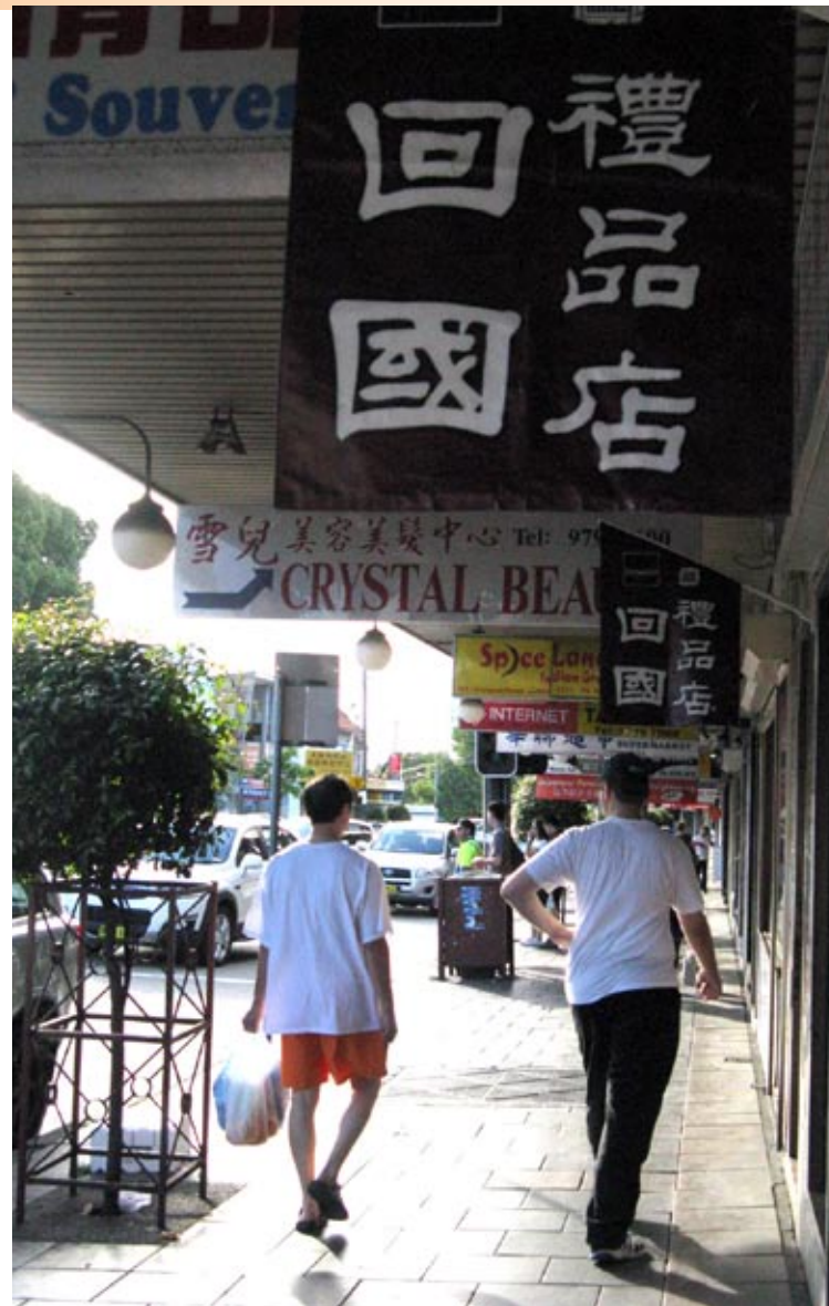
Liverpool Road Ashfield.

and the importance of place. However, these modes of translocal belonging among the Chinese residents have also constituted a sense of alienation among many elderly Anglo-Celtic residents (Smith, 2009, 195). Ashfield will continue to be enriched by translocality as evidenced in the colourful costumes of the Tongan and Fijian communities that attend the local church, the Polish Club with its enormous portrait of Kosciusko in the dining room, and the had written signage in Russian at the Shanghai Night restaurant that attracts the Russian immigrants who lived in exile in Shanghai in the early 20thc (Wise, 2009, 98).