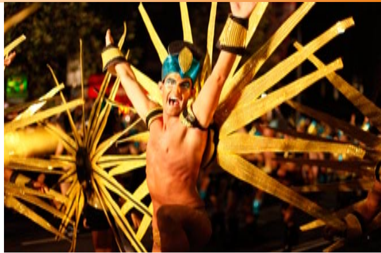
Performer in the 2010 Mardi Gras Parade