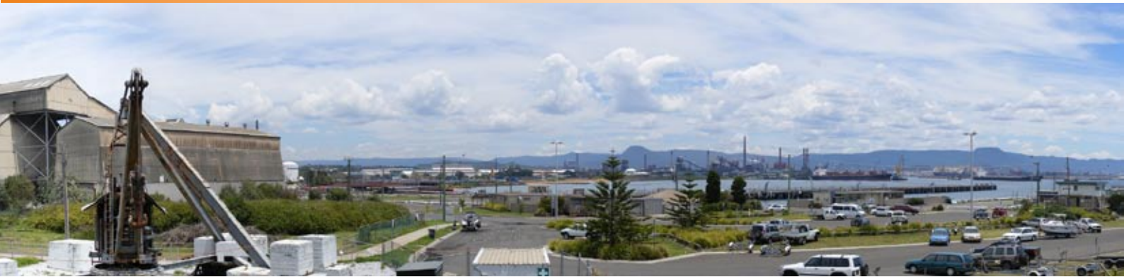
Port Kembla, NSW