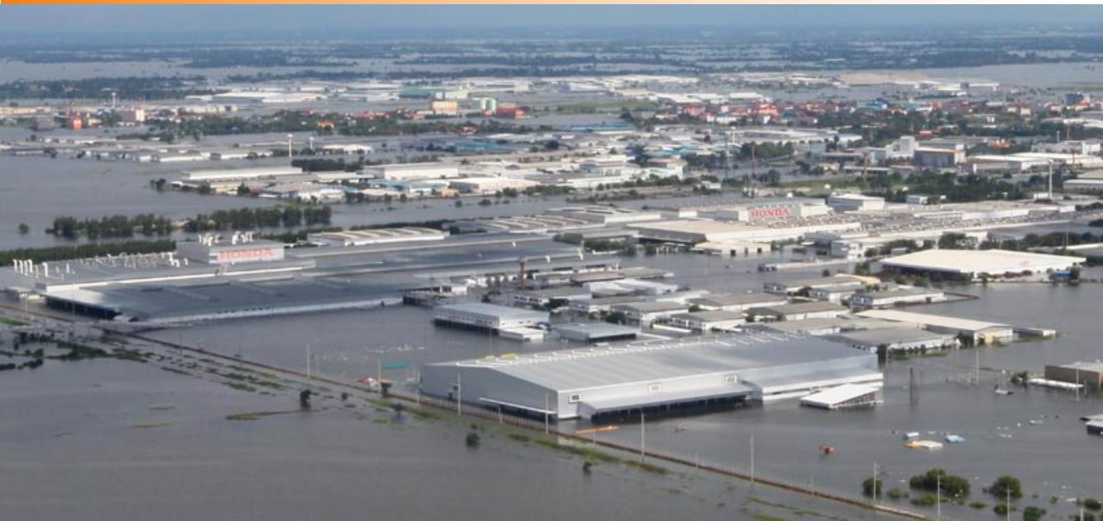
Floodwaters inundated Rojana Industrial Park, Ayutthaya Province, Thailand during October 2011.