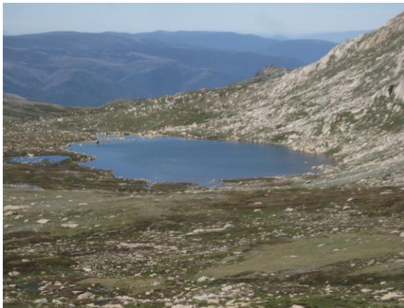
Lake Cootapatamba, Snowy Mountains, NSW.